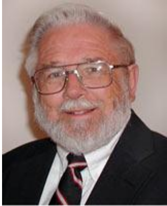
Beginning with God: A Basic Introduction to the Christian Faith