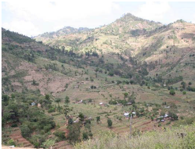
Hills once covered by forests have been stripped for firewood or farm

Care of Creation was founded in 2005 as an evangelical environmental mission agency – one of the first organizations to seek to integrate a response to the global environmental crisis with the evangelical church's traditional commitment to outreach and missions. At Care of Creation we believe that loving God & loving God's people necessarily implies loving and caring for God's creation.