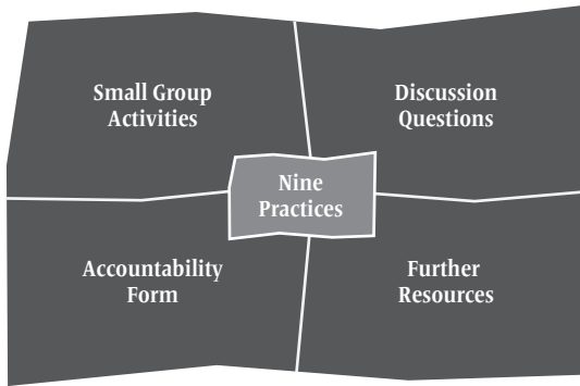
Figure 2. Resources in this book

With God's help, we can recover our humanity and pursue love, peace, justice, and reconciliation. These nine practices help encourage us to transform a dehumanized world into God's world.